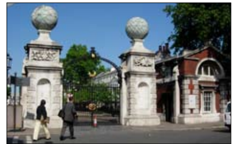
The pedestrian gates on each side of the West Gate are always open between 8:00 and 18:00 daily. From here cyclists can wheel their bikes through the College grounds, but not ride them.