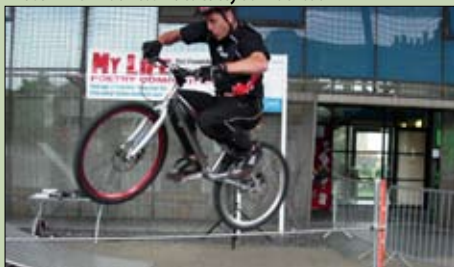
Bike Magic included a BMX display