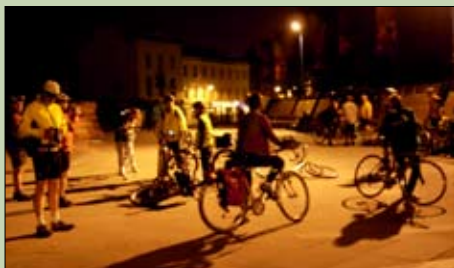
Midsummer Madness ride: Cutty Sark at 2:00