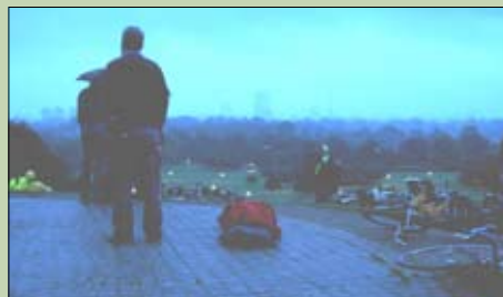
Just before dawn at Primrose Hill: rain, clouds, wet cyclists