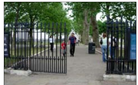
The temporary shared-use path at Cutty Sark Gate leading to both the East Gate and Trafalgar Gate (closed until works are completed in October 2006). The Trafalgar Gate is sited approximately where the "Tradesman's" entrance and courtyard existed during Tudor times.