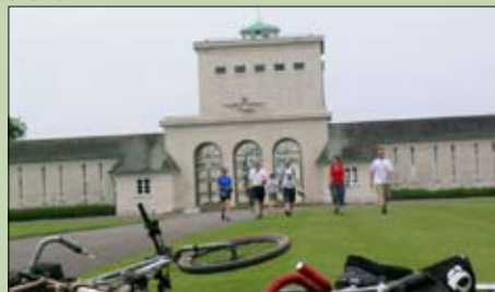
On the Windsor ride

There were many events in and around Greenwich to celebrate this year's Bike Week in late June.