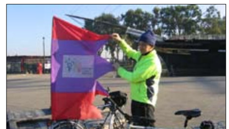
Preparing for the Climate Change Rally – Cutty Sark, November 2006