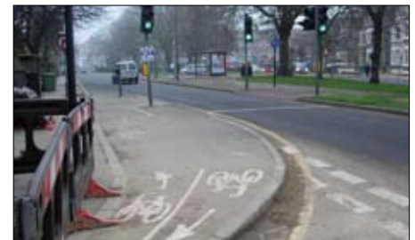
Link 59 – Contrary to what the two Hexagon Estate residents stated, the toucan and the cycle signs at Charlton Road indicate that a cycle path existed