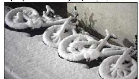
Not a recommended way to park bikes