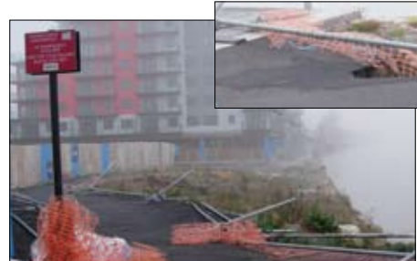
Mast Pond Wharf, the shame – Greenwich Council dithers while the river erodes the Thames Path away (inset)

The Council said that the problems would be resolved around Christmas but it is now nearly Christmas and nothing has been done. For nearly two months. Come on, the fencing could have been fixed in an hour (or less) and the hole filled using a small concrete mixer. Whoever is responsible should behave responsibly.