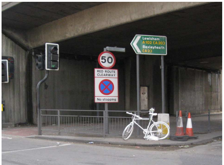
Greenwich Cyclists have placed a white bike and flowers at the scene

The lorry did not stop at the scene. It is described as having blue material ( e.g. canvas, or plastic sheeting ) on its side. Anyone who witnessed the collision or has information that may assist police should call the Collision Investigation Unit at Catford Traffic Garage on 020 8285 1574.